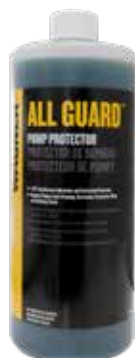
Wagner All Guard 1661100

Wagner has a range of cleaning and maintenance products that is highly recommended to use when cleaning after use on all DIY and Professional airless sprayers. It lubricates and protects all the key valves and moving parts, thus extending the life of these wearing parts and the unit.