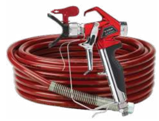
■ The PowrBeast 7700 and 9700 sprayers come complete with RX-Pro Gun, 517 TR' Reversible Tip and 1/4" x 50' Airless Hose.