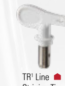
TR¹ Line Striping Tip