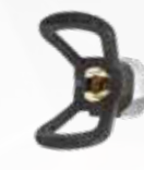
No Build Tip Guard