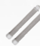
White 60 Mesh Filters (2-pack)

*Included with each PowrLiner 3500, 3500S, and 4500. LS-10 Liquid Shield is provided in a 4 ounce trial bottle.