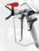
RX-80 4-finger Gun with TR¹ Tip