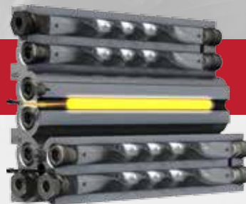
SureFire™ Block Heater

Patented High Efficiency Aluminum Mass Heater