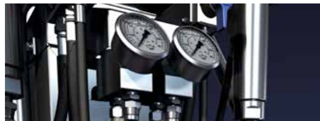
SureFire™ Hose Heater