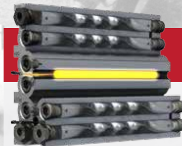
SureFire™ Block Heater

Patented High Efficiency Aluminum Mass Heater