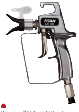
PowrLiner™ 550 and 850 include LX-40 spray gun with in-handle filter and premium TR1 line striping tip.