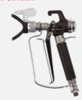
All PowrLiner 55 series include S-3 Stainless Steel spray gun with premium TR1 line striping tip.