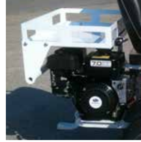
SureTrak™ Floating Gun Kit